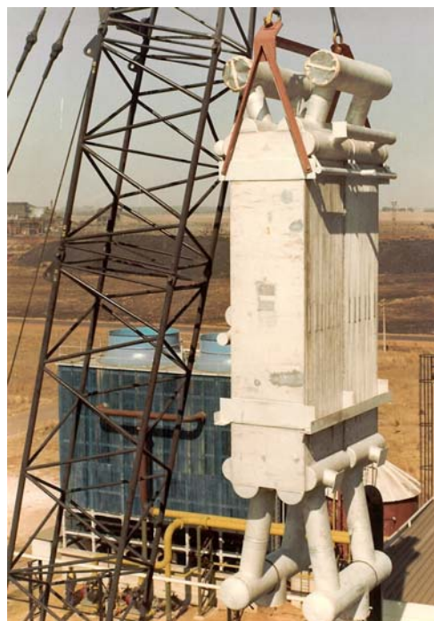
Figure 1. Shutdown of an air separation plant. Abnormal maintenance of the reversing heat exchanger.

The tendency is to assume that the organisational roles and responsibilities appropriate for day-to-day operations are just as applicable for shutdown projects. This is not the case. Organisations are in the main designed to control routine – including those where routine events are chaotic! Even when well-