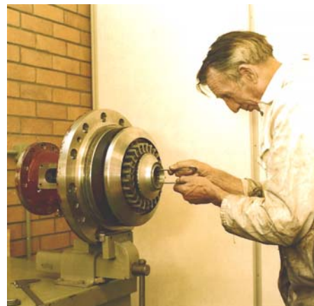
Figure 3. Stripping the 40,000 rpm rotor of an air separation plant expansion turbine. When an internal examination of a critical machine is planned, expect to discover a defect that hasn't previously revealed itself and ensure the availability of potentially necessary spares.